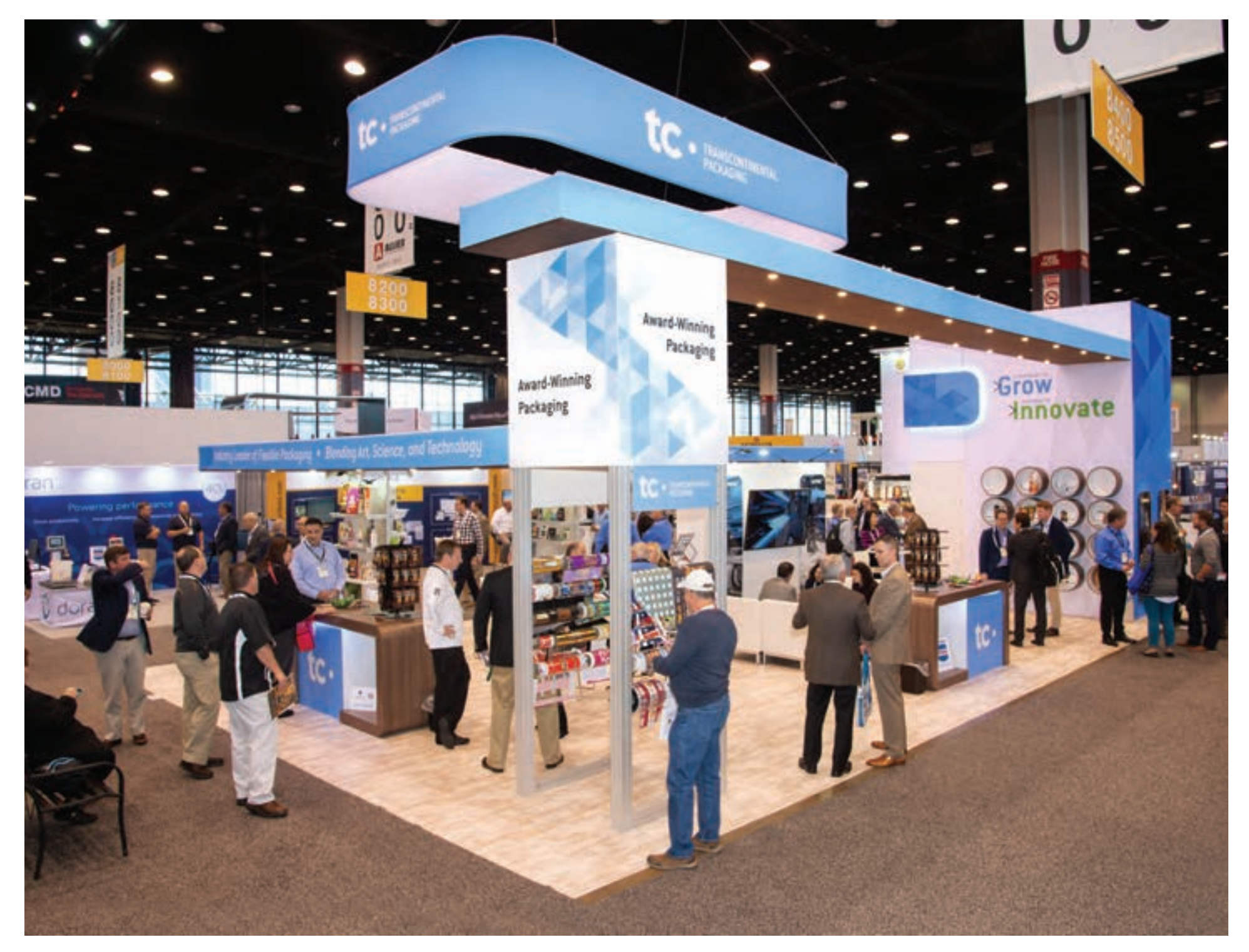
TC Transcontinental Packaging exhibiting the company's fast-growing range of flexible packaging innovations and sustainability solutions at last fall's PACK EXPO International 2018 packaging technologies exhibition in Chicago, generating a lot of positive feedback from the show's visitors and many other exhibitors.

is what he set out to do with TC Transcontinental.