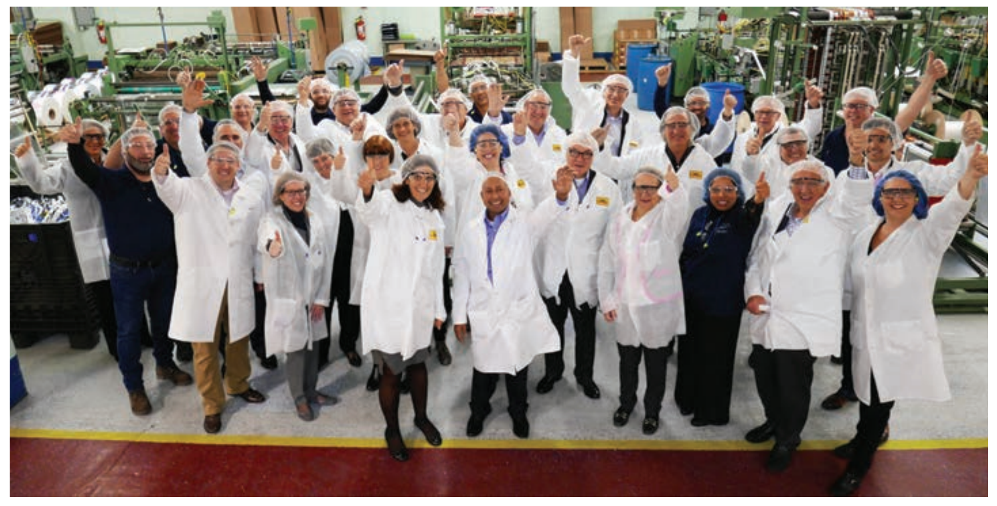
Members of TC Transcontinental's Board of Directors and Senior Executive Committee pose for a group shot at the company's packaging facility inBrooklyn, N.Y., in an exuberant display of enthusiasm for the company's ongoing growth and transformation into one of the world's largest integrated producers and converters of flexible packaging products.