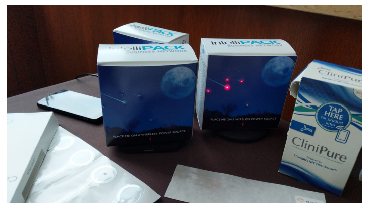
Above: a wirelessly powered package demonstrator that lights up by a phone or wireless emitter

Second item was a wirelessly powered package that lights up by a phone or wireless emitter, a joint venture between two member companies where printed electronics was put on the package and graphics added afterwards